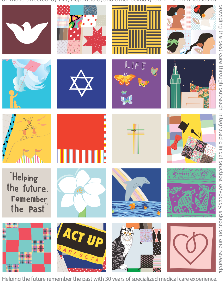
Helping the future remember the past with 30 years of specialized medical care experience.

of those affected by HIV, Hepatitis C, and other sexually transmitted diseases by